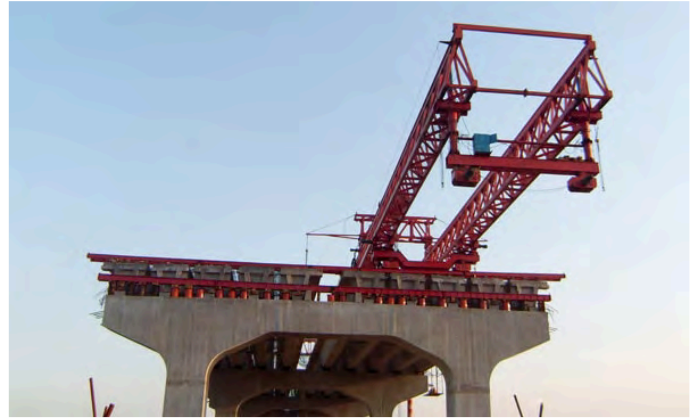
Double Truss Beam Launcher

The twin-truss type is more commonly used worldwide while the single-box type is a special design for erecting railway T-Shape Bridge Beam. The single box beam launcher is generally more efficient and lighter in weight, and is perfect for erecting pre-cast beams on tight horizontal alignments as well as for lifting beams from the sides of the bridge.