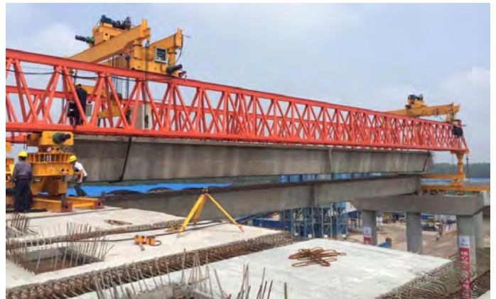
Single Box Beam Launcher